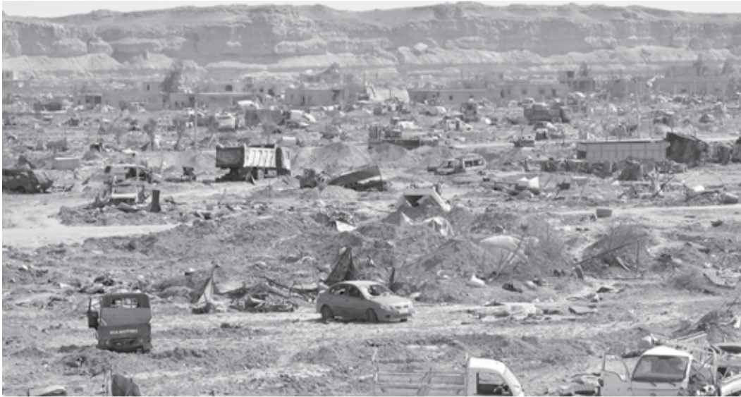
Picture shows the fallen Islamic State group's last bastion in the eastern Syrian village of Baghuz after the defeat of the jihadist group.

Children who went to IS-run schools learnt to count with