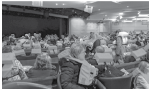
Passengers on board the Viking Sky, waiting to be evacuated, off the coast of Norway on Saturday