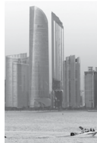
General view of Abu Dhabi

Abu Dhabi derives about 50 per cent of its real gross domestic product and about 90pc of central government revenue from the hydrocarbon sector, according to ratings agency