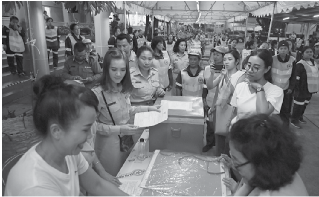
People watch the vote counting process at a polling station in Bangkok

There was a high turnout as voters flocked to schoolyards, temples and government offices across the nation, their enthu-