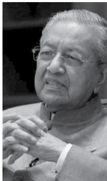
Prime Minister Mahathir Mohamad

Both countries are struggling to spur demand in palm oil, which is used in everything from soap to chocolate.