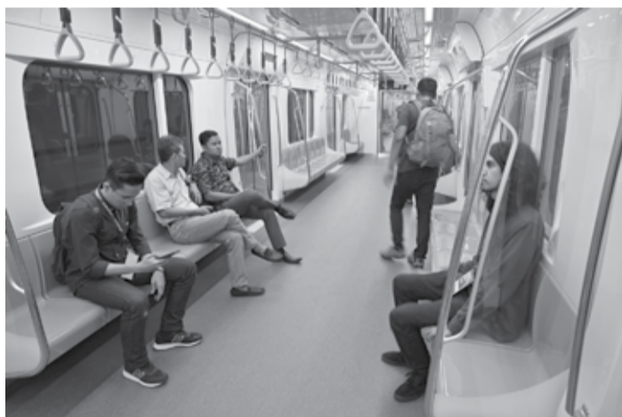
Passengers on board a Jakarta mass rapid transit (MRT) coach during a trial run in the city

It aims to cut travel times between the two points to just