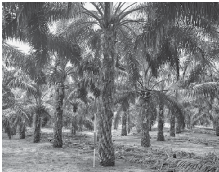
Palm oil trees at the Malaysian Palm Oil Board (MPOB) research station in Bukit Lawang in southern Johor state

"If they keep on taking action against us, we will think of buying airplanes from China or any other country," he was quoted as