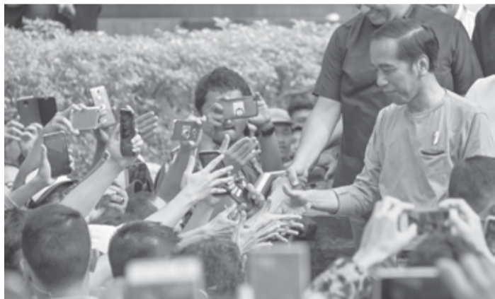
Indonesia's President Joko Widodo (R) greets people gathered outside the Bundaran HI mass rapid transit (MRT) station

30 minutes from around two hours, offering some relief to frustrated commuters long used to spending much of their day stuck in traffic.