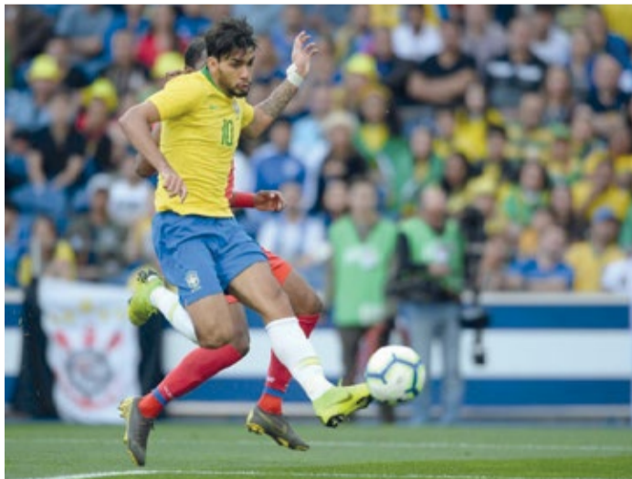
Brazil's Lucas Paqueta shoots to score

Brazil's Lucas Paqueta scored his first international goal against Panama