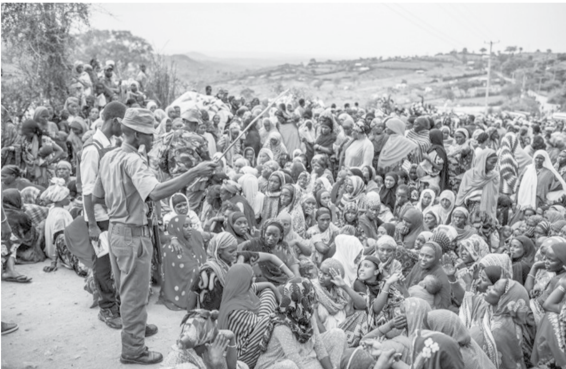
Ethiopian refugee women wait to receive non-food items distributed by the Kenyan Red Cross.

Deeply traumatised women socialised to "know their place" often have zero sense of their rights or options. We thus must educate all our girls to know their rights; to know how to assert themselves in the face of male aggression and harassment; and to know they are capable of