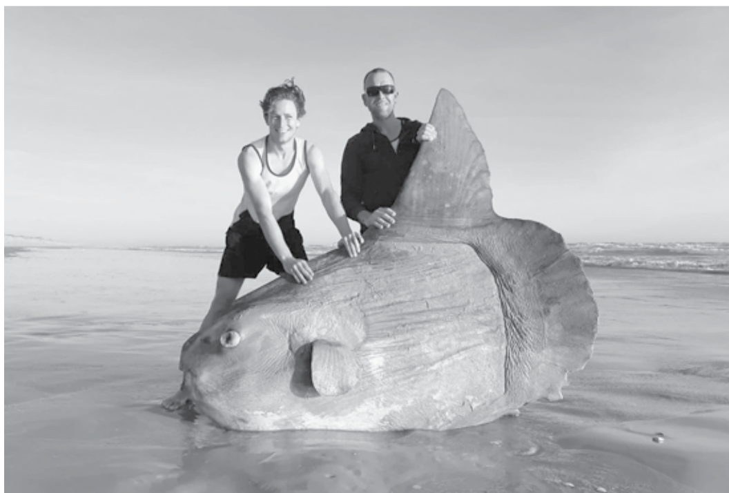
A sunfish that was washed ashore and found dead in Coorong, near the mouth of the Murray River in South Australia.

"The amount of news and media from all over the world wanting to report it has been on another level," Linette Grzelak, who posted the image to Face-