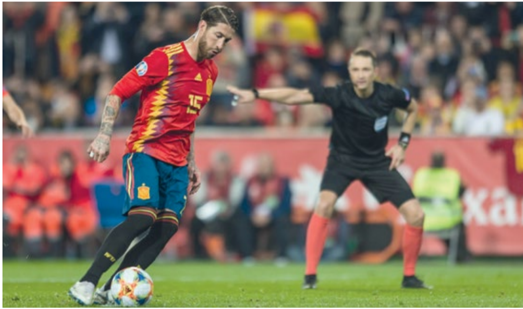
Sergio Ramos chips the ball past Norway's goalkeeper from the penalty spot

Coach Luis Enrique named an attacking line-up, with Marco Asensio, Alvaro Morata and