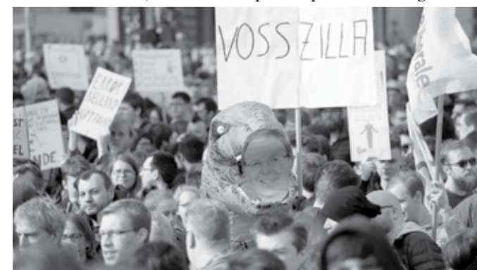
A protestor holds a plastic "Godzilla" and a portrait of German member of European Parliament Axel Voss during a demonstration under the slogan "Save The Internet" against the planned copyright law in Berlin

In the reform, for the first time European law would hold platforms legally responsible for enforcing copyright, requiring them to check everything that their users post to prevent infringement.