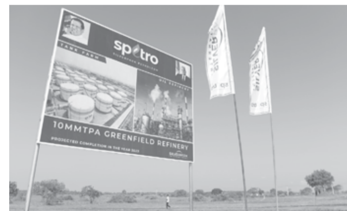
A man walks past a billboard of a construction site of an oil refinery and storage facility in the southern port city of Hambantota