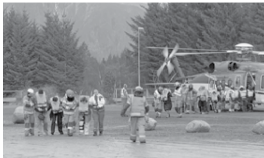
Stranded passenger that were rescued by helicopter from the cruise ship Viking Sky are pictured on March 23, 2019 on the west coast of Norway near Romsdal