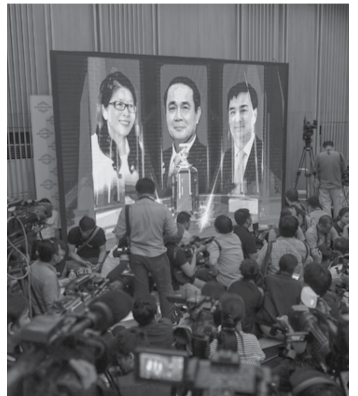
Journalists wait at Phalang Pracharat party headquarters in Bangkok

Thaksin has lived in self-exile since 2008, but he looms large over Sunday's election. His affiliated parties have won every Thai election since 2001, drawing on loyalty from rural and urban poor.