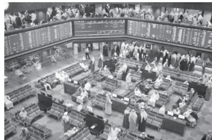
Traders on the floor of Saudi Stock market

Saudi Arabia's stock market closed lower yesterday, along with other Gulf markets, having ended the previous week at its highest in nearly four years after inclusion in the FTSE Russell's emerging-market index.