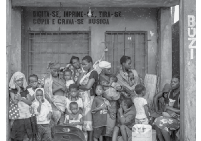
Women and children take a shelter from rain in Buzi, Mozambique