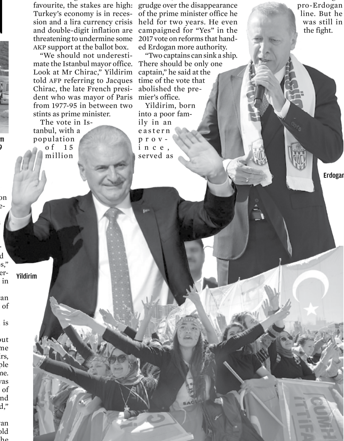
Supporters of Turkish President Tayyip Erdogan wave flags during a rally

The CHP candidate lamented that conditions were not equal, especially with most Turkish media taking a pro-Erdogan line. But he was still in the fight.