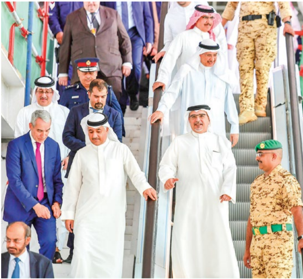
HRH the Crown Prince tours to review the projects with ministers and senior government officials.

HRH the Crown Prince also reviewed the progress of the National Air Traffic Management Program (ORAT), which was recently introduced to ensure seamless operations across