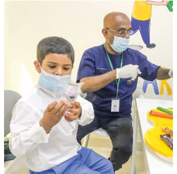
American Mission Hospital medical team held a community outreach programme at the Basma Centre for Special Education. Included in the programme were basic health checks and dental screening to identify health problems. The aim of the programme was to screen the children to discover health issues.