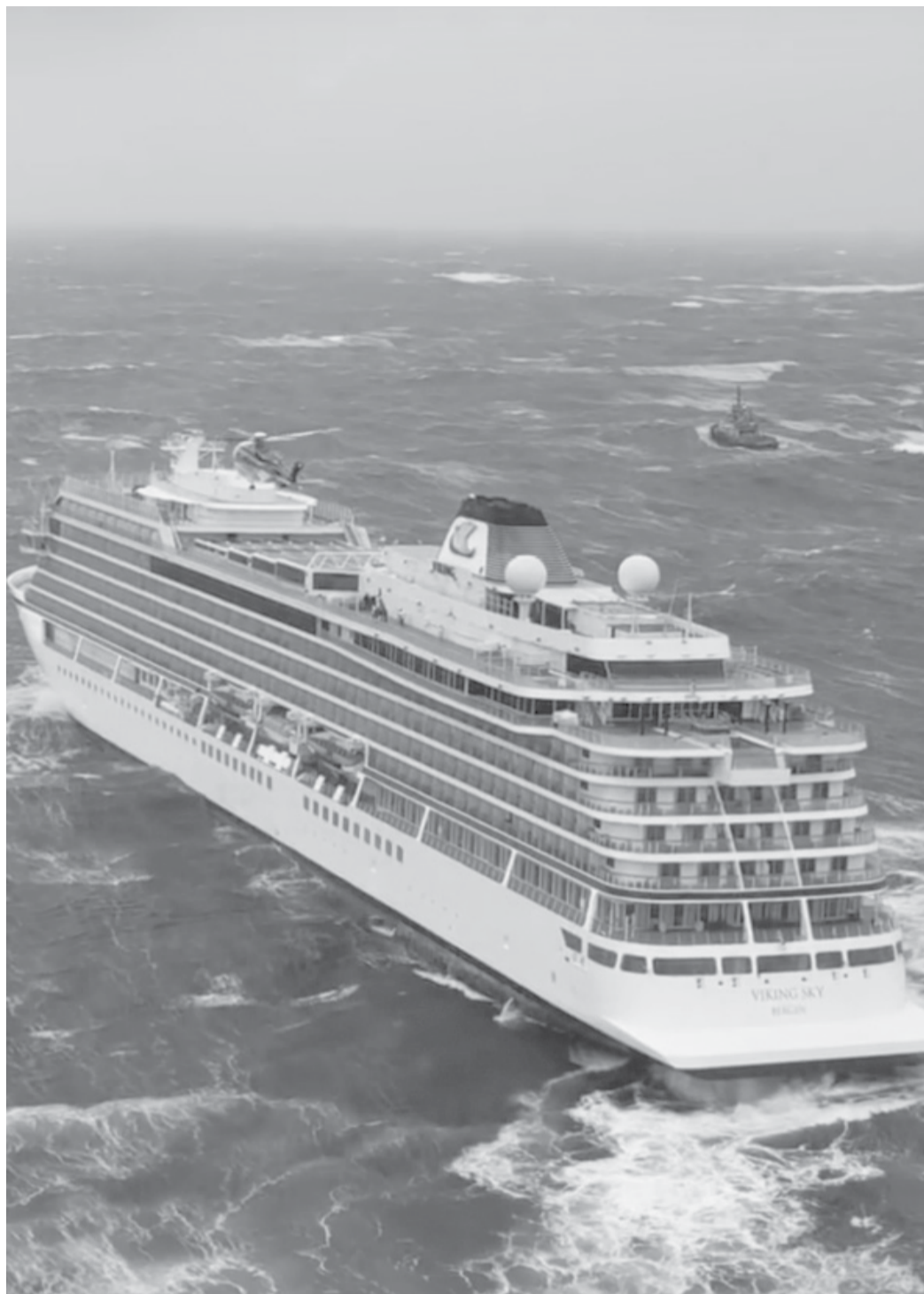
The Viking Sky lost power and started drifting mid-afternoon Saturday