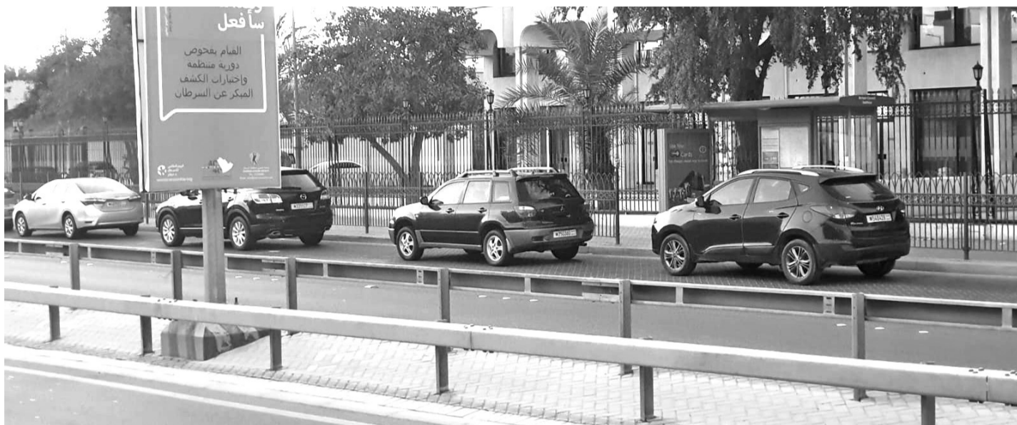
Civilian vehicles occupying areas designated for Red Buses near the British Council in Salmaniya.

we started over four years ago, and I am sure it was a problem for the previous company as well," revealed the spokesperson.