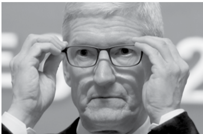
Apple CEO Tim Cook attends the Economic Summit held for the China Development Forum in Beijing