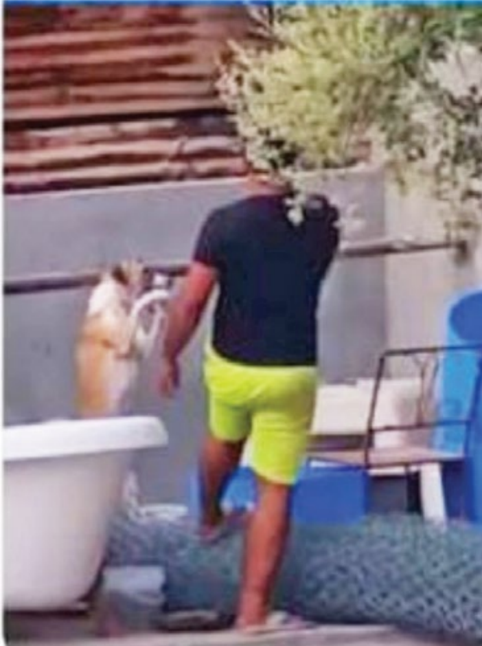
A screenshot of the video that went viral.

The footage was widely shared by animal activists and netizens on local social media pages and groups, in a bid to publicise the man's face and