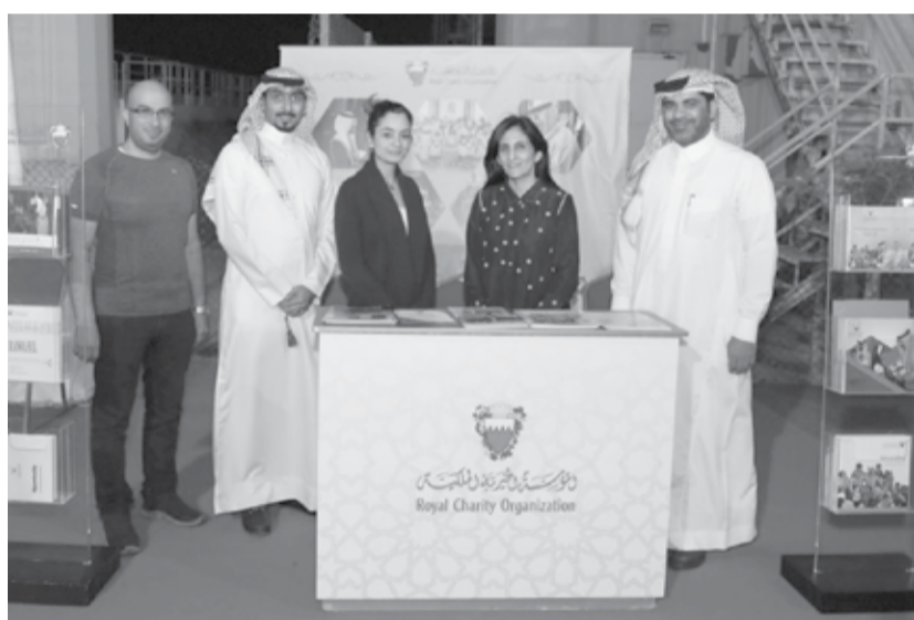
Galleria Mall, Bahrain's open-plan shopping destination in New Zinj held its first food market. The theme of the food market was Discover #Block331GalleriaMall which offered a variety of cuisines served up by the tenant restaurants. The event was in support of the Royal Charity Organisation's Al Faris Project to donate insulin pumps to children with diabetes. Also present was the Bahrain Diabetic Society. The event also featured various entertainments and free blood sugar and blood pressure test

The committee presented - during the meeting - a study of utilizing framework agreements with ICT suppliers - provided by the Sultanate of Oman. It also discussed a proposal on developing the GCC Portal that the United Arab Emirates presented. After viewing the agenda of the 15th meeting for the National Center of Computer Emergency Response Committee, the committee approved the recommendation put forward.