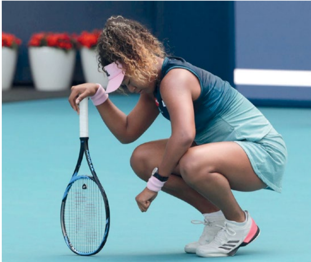
Naomi Osaka of Japan reacts in her match against Su-Wei Hsieh of Taipei

Ferrer, 36 and ranked 155th in the world, received a wild card into the tournament as he