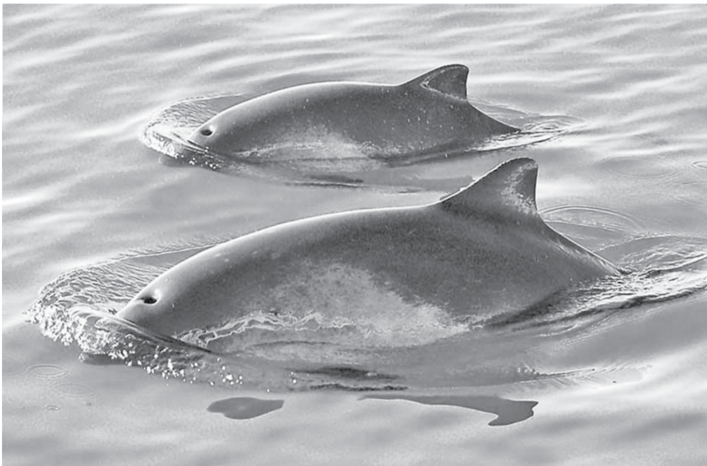
There is little time left to act to save the vaquita, yet there is hope.

The small-scale fishermen who live on the sea's western and northern shores motor out in cheap fiberglass skiffs known