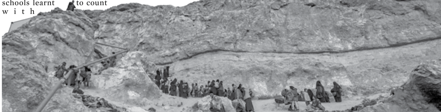
People said to be members of the Islamic State (IS) group exit with children from the village of Baghuz in the eastern Syrian province of Deir Ezzor (file)