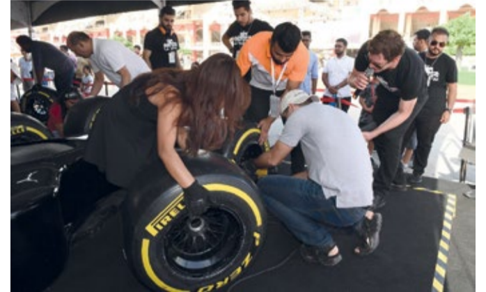
Race-goers engage in activities at BIC's F1 Fanzone