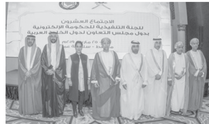
Group photo of GCC eGovernment Executive Committee members